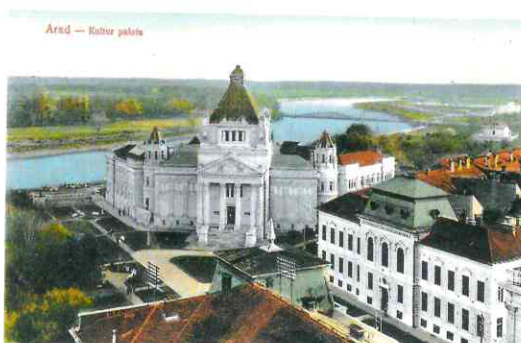
Postcard of the Arad Cultural Palace 1916