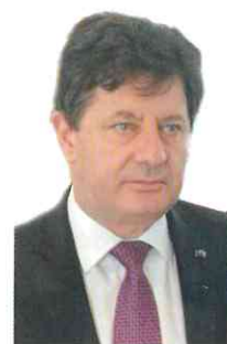
Iustin Cionca, President of the Arad County Council